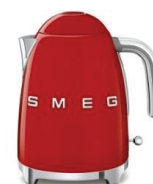
1.7L RETRO KETTLE