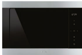
60cm CLASSIC MICROWAVE