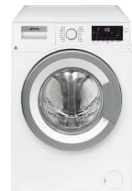
9kg WASHING MACHINE