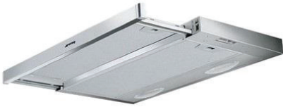
60cm TELESCOPIC EXTRACTOR