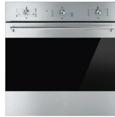
60cm ELECTRIC OVEN