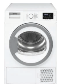
8kg TUMBLE DRYER